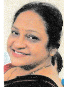
Sergt. At Arms