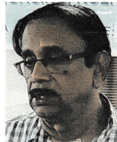
Public Image Chair